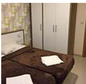
A twin standard double bedroom

Bus stops are less than 5 mins from the Apartments. 2-hour ticket €2.00, 7-day ticket €21.00. For more details please visit www.publictransport.com.mt