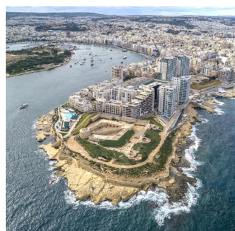
Splendid bird's-eye view of Tigne