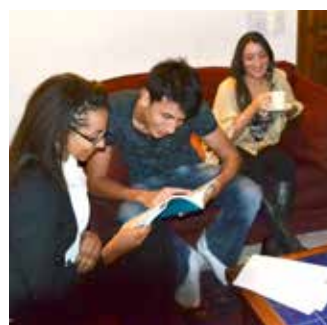
A relaxing place to stay