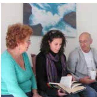
Keep learning with your host

2-hour ticket €1.30, day ticket €1.50, 7-day ticket €6.50, night single journey ticket (weekend only) €2.50 - subject to change.